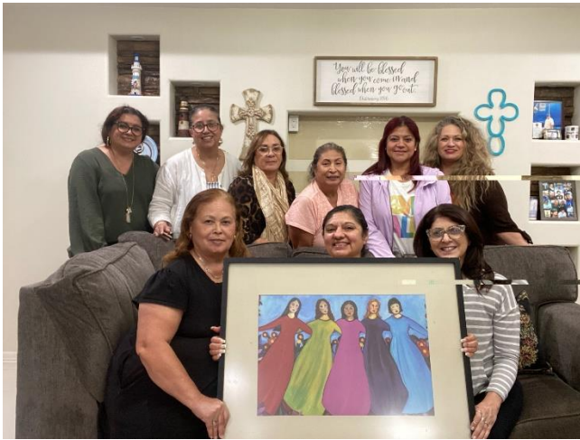
Upper Rio Grande Valley Comadres Network