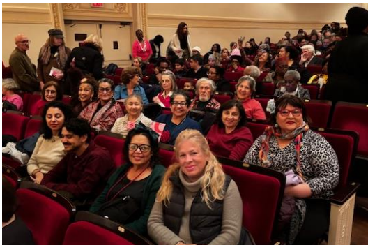
New York City Comadres Network (NY)