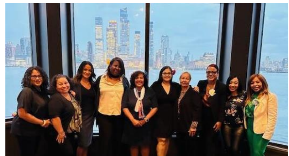
Comadres at the New Jersey Latinas of Influence Awards