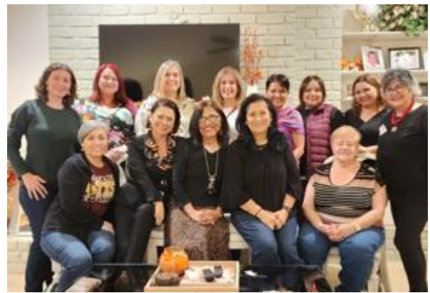
NW Austin (Round Rock) Comadres Network (TX)