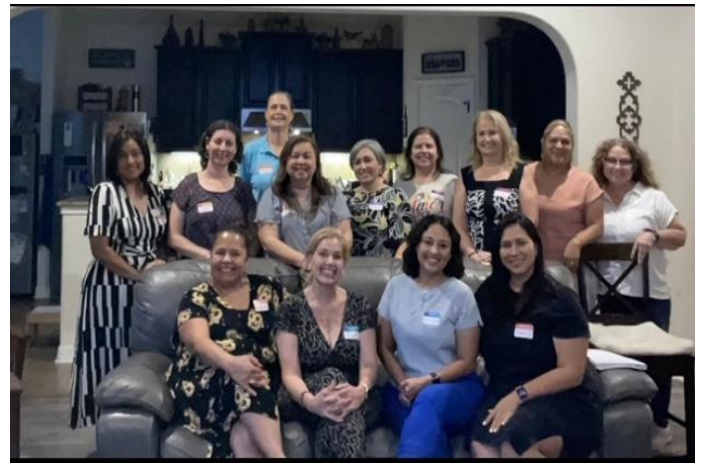
NW Austin Comadres Network