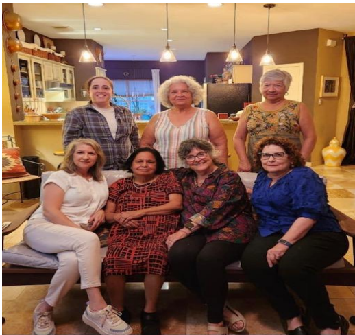
SW Austin Comadres Network