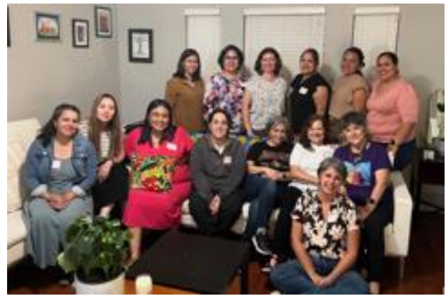
NW Austin (Cedar Park) Comadres Network (TX)