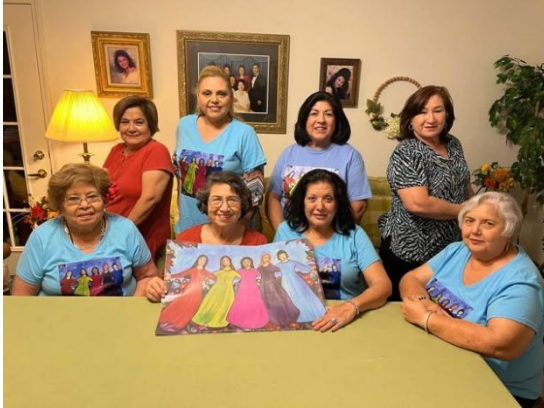
Mid Valley Comadres Network (TX)

Showcasing in person Comadrazos for 2024.