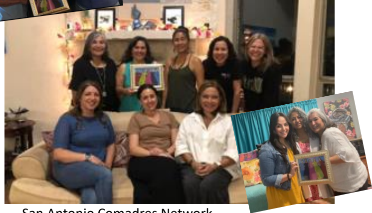
San Antonio Comadres Network