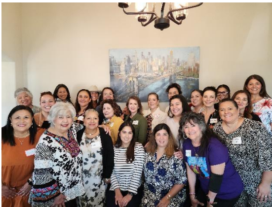
SW Austin Comadres Network (TX)