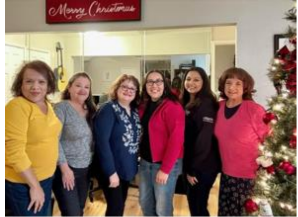
Inland Empire Comadres Network (CA)