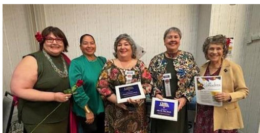
(Left) Comadres at the Florida Latinas of Influence Awards